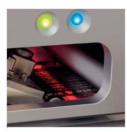
Videojet iAssure<sup>™</sup> technology, a built-in code quality checker helps reduce waste and rework