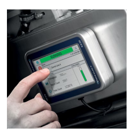
High resolution graphical user interface with a WYSIWYG job display