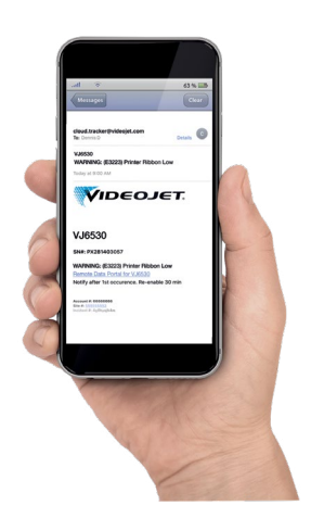
* Subject to availability in your country